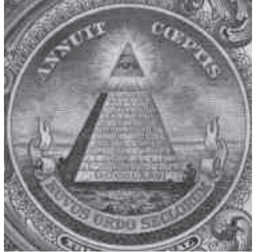
Detail from United States One-Dollar bill

action” (following Artaud), investing the total theatrical space with archaic, spiritualistic, and shamanistic rituals. Meese has been obsessing over the grand Germanic narration for many years, producing and assembling hundreds of sketches and drawings and extensive writings, documents, and manuscripts. His habitual artistic method of collecting and juxtaposing different forms and types of materials—photographs, drawings, paintings, sculpture, writing, stage sets, installations, and theater props—literally coagulates on stage into a slow-motion, at times violently eruptive, performative / aesthetic collage. The pantheon of historic and fictional characters—more often than not composite figures such as Mother Parsifal and Artaudaddy—are impersonated by the artist’s multiple personas or artist-egos (Jonathan, ME, Meeseewolf, and others) in a real-time permuting défilé of Parsifal, Hagen of Tronje, Saint-Just, Kundri, Wagner, Nietzsche, Hitler, and so on. Meese’s “oeuvre is based on the principle of generating many different references starting from a single center, namely Meese himself as an artist,” states Fabrice Hergott. 6 Through this process the artist effectively is and becomes a vehicle for his own citations.